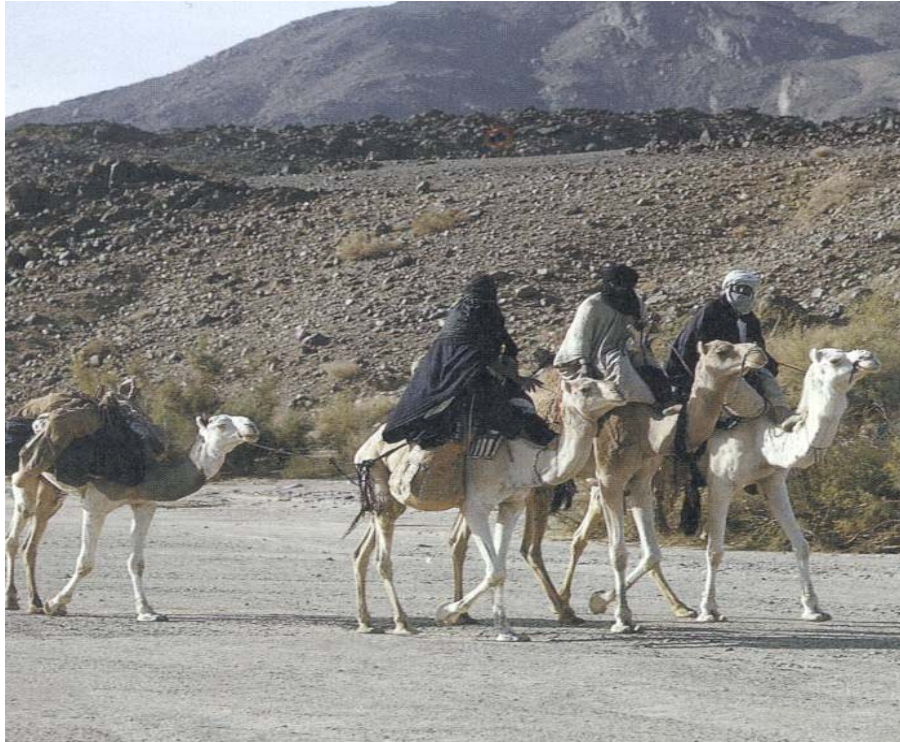
Living in a Desert by Allan Fowler