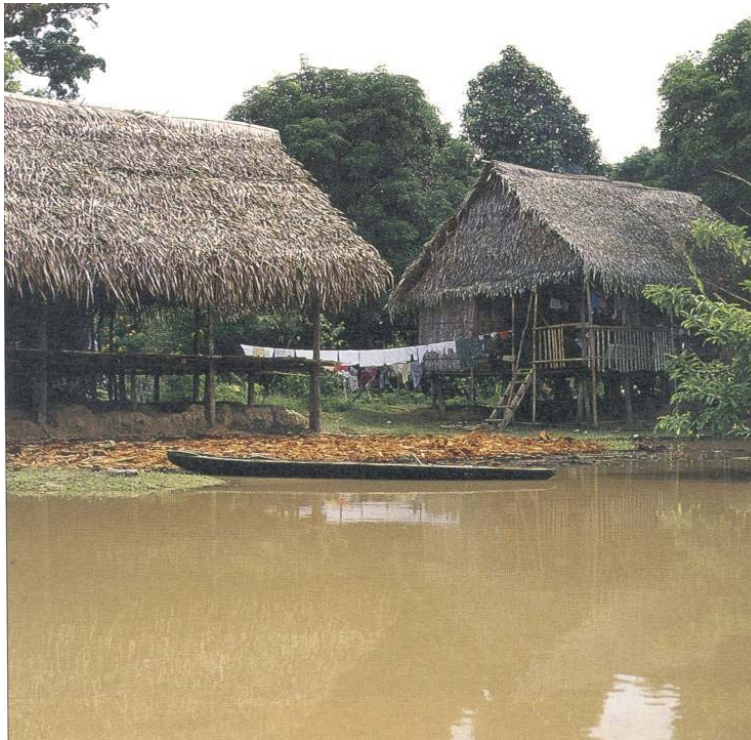
Living in a Rain Forest by Allan Fowler

1. What materials are rainforest houses made of?