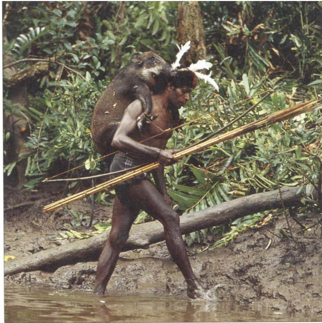
A rain forest hunter