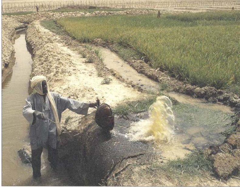
This desert farmer waters his crops from an irrigation ditch.