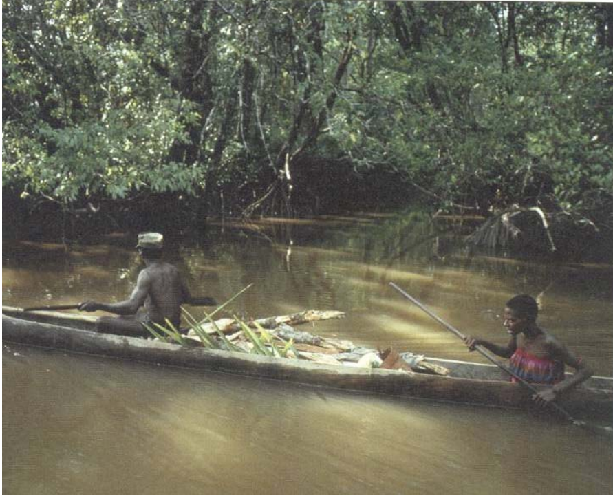
Living in a Rain Forest by Allan Fowler

1. How do people travel in the rainforest?