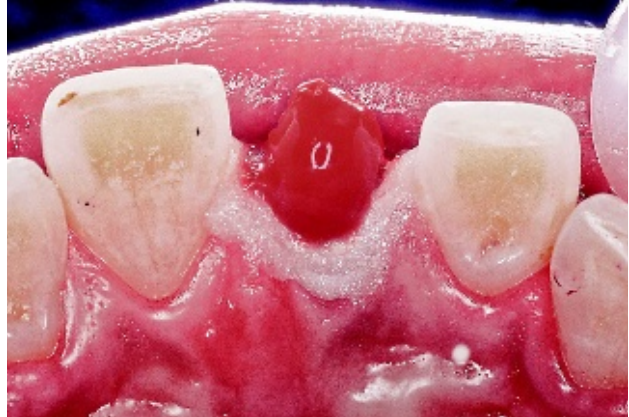
Fig. 2-17 Power whitening gel with light activation.